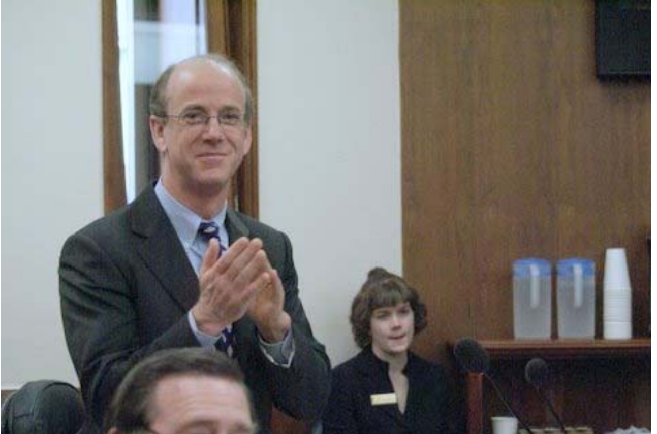
Senator Hollis French introduces a guest during a Senate floor session.