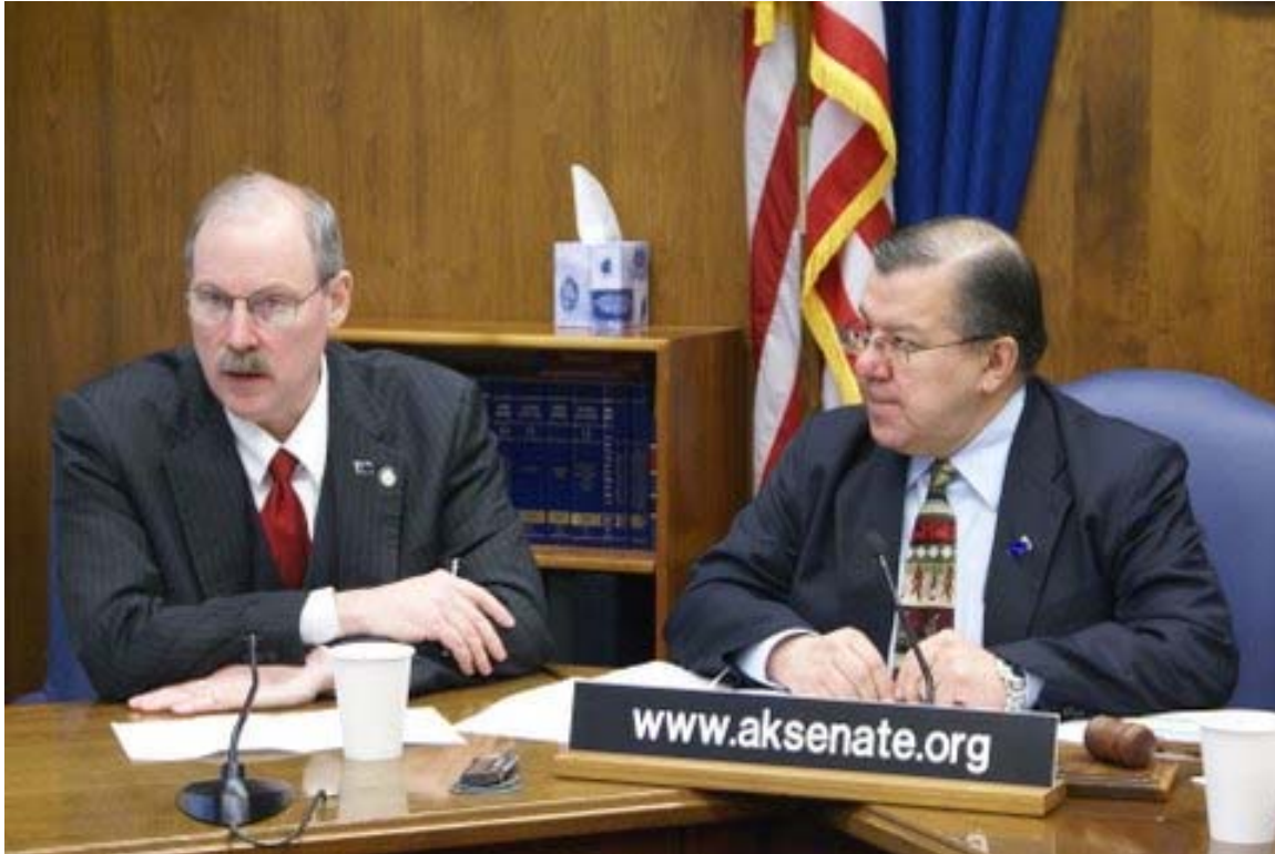
Senate Finance Co-Chairs Bert Stedman and Lyman Hoffman discuss the operating budget during a March 21 st news conference.

The Senate started its review by applying the following three principals to the FY 09 spending plan: